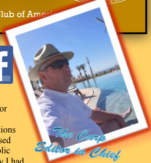
The Corp Editor in Chief